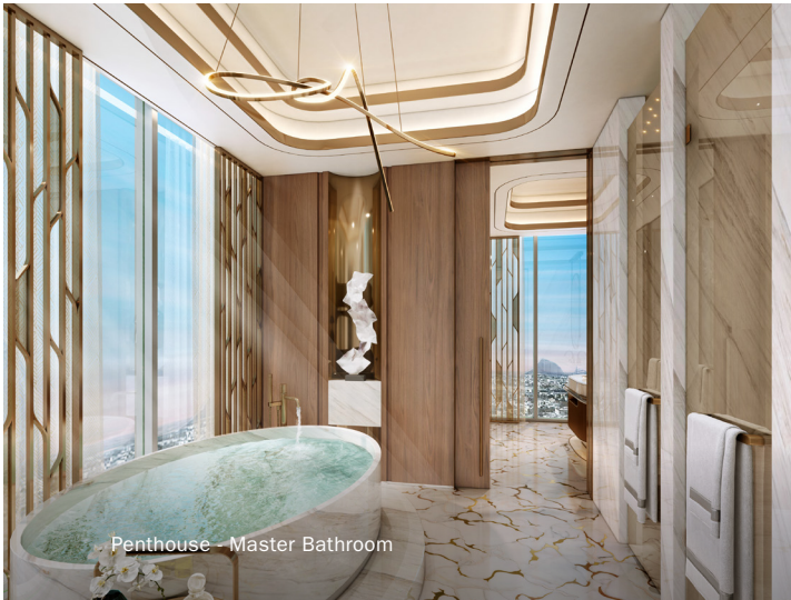
Penthouse - Master Bathroom