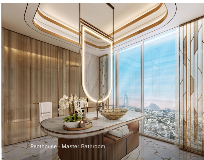
Penthouse - Master Bathroom