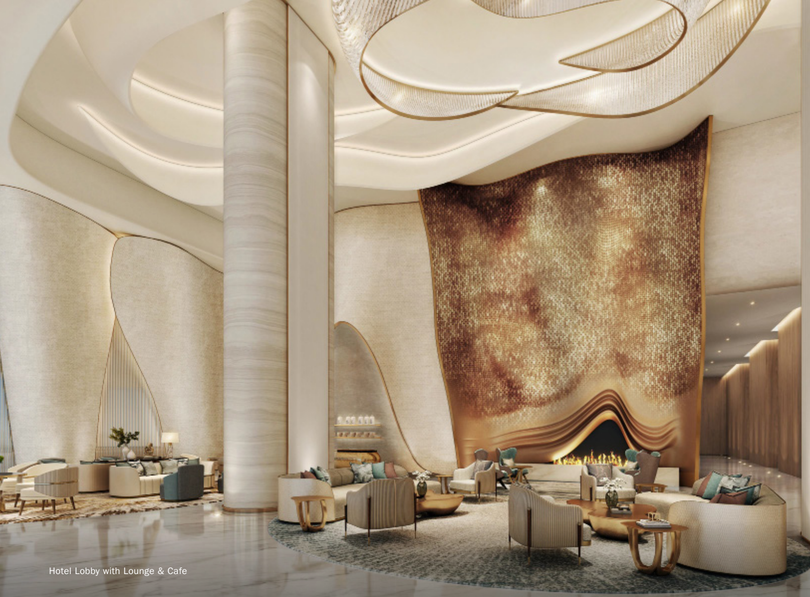
Hotel Lobby with Lounge & Cafe