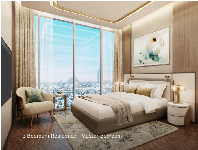
3-Bedroom Residence - Master Bedroom

Here's where you can truly see the world as you want. As your gaze wanders across the horizon, unfold the captivating views of the sea, encircled by the city's dramatic skyline.