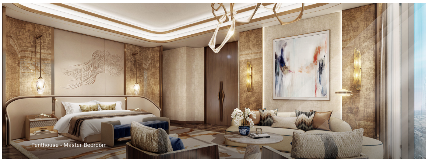
Penthouse - Master Bedroom

Rich marble textures and leather, complemented by walnut wood and bronze metal accents, with shades taken from different seasons of sunset, symbolise balance and freshness.