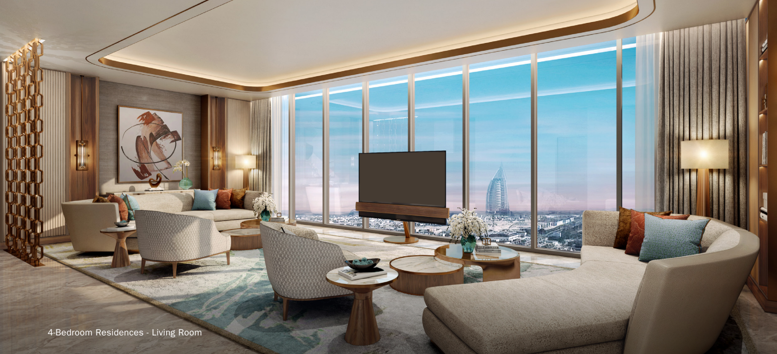
4-Bedroom Residences - Living Room