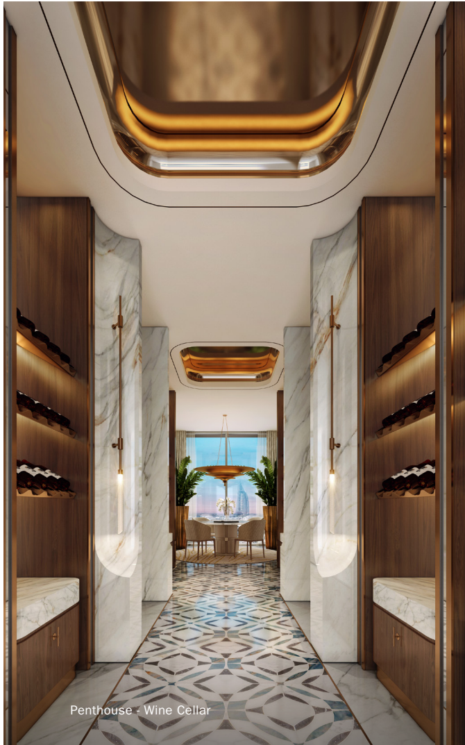
Penthouse - Wine Cellar

The fluent patterns, refined motifs and details are inspired by the incredible views from the residences.