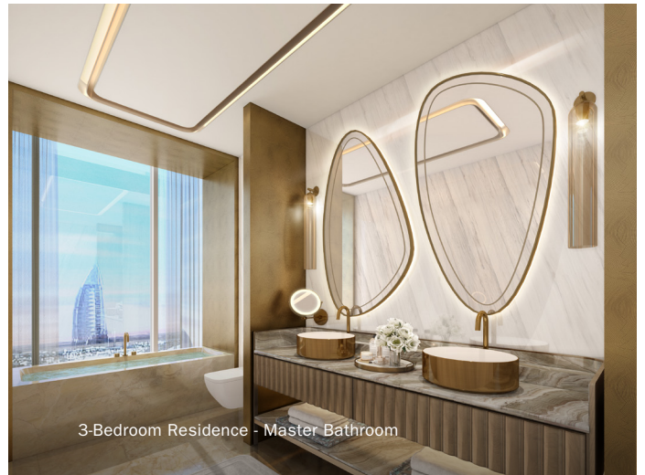
3-Bedroom Residence - Master Bathroom