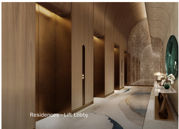
Residences - Lift Lobby