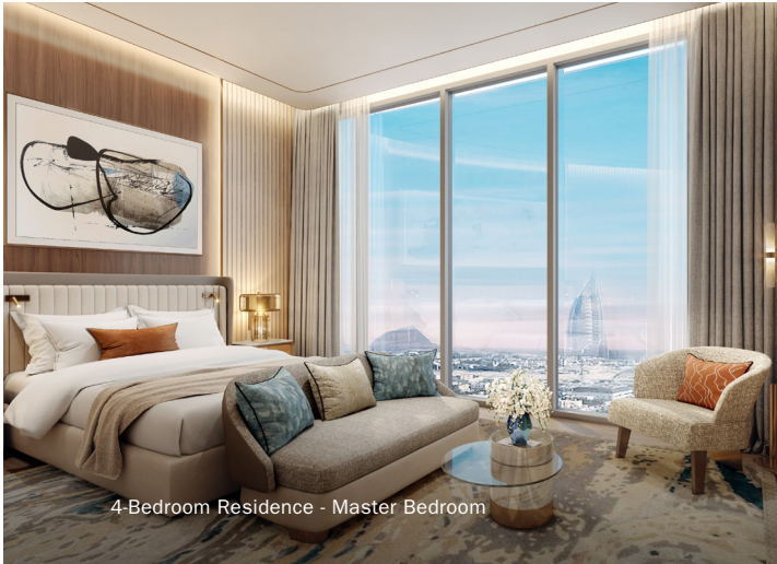
4-Bedroom Residence - Master Bedroom