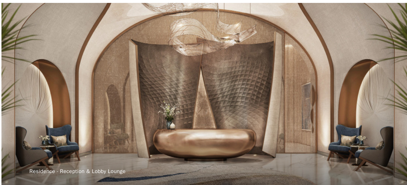
Residence - Reception & Lobby Lounge

The interiors of Fairmont Residences Dubai Skyline, designed by award-winning interior designer Kristina Zanic, embody the essence of Dubai - a luxurious blend of warmth, elegance, and glamour rooted in rich Middle Eastern heritage.