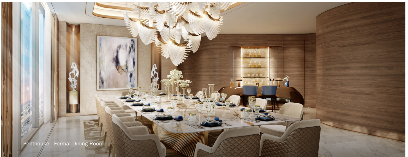
Penthouse - Formal Dining Room

Images in this factsheet are for illustrative purposes only. The developer reserves the right to change or substitute all or parts of the materials, appliances, equipment, fixtures, and/or other details without prior notice.