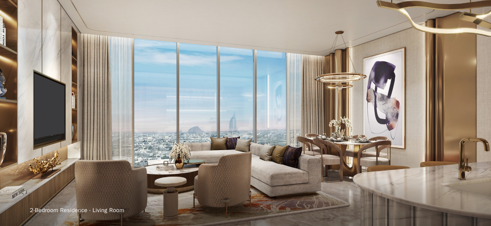
2-Bedroom Residence - Living Room